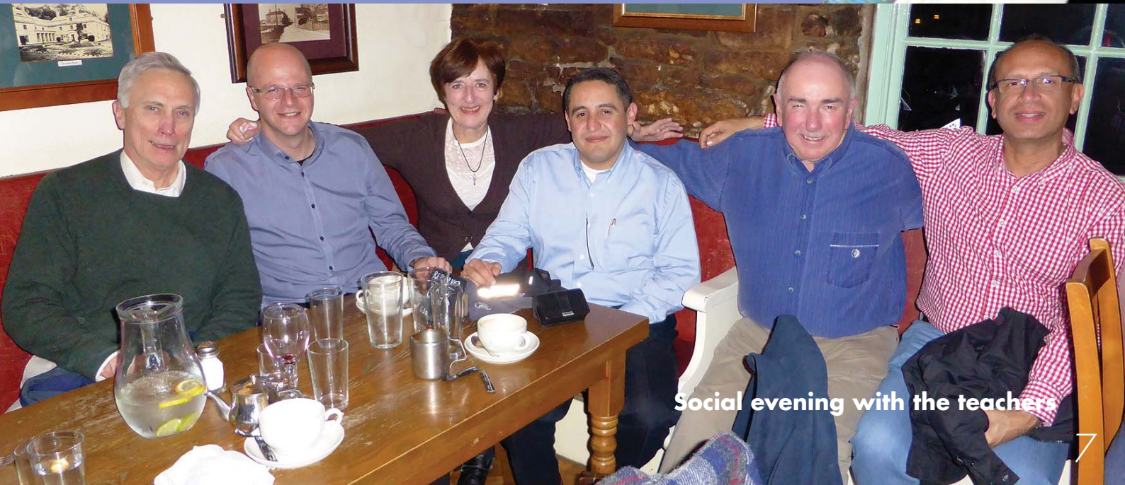
Social evening with the teachers