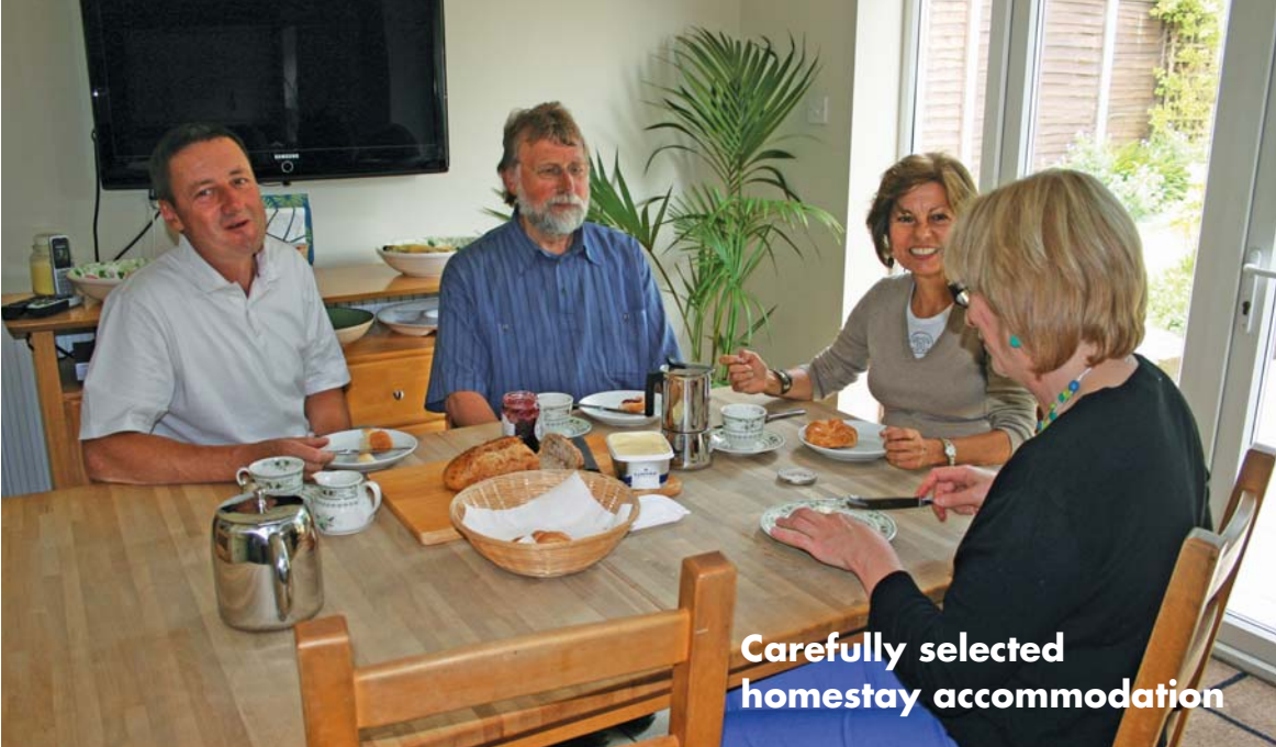
Carefully selected homestay accommodation

69 years' experience in teaching English to the world!