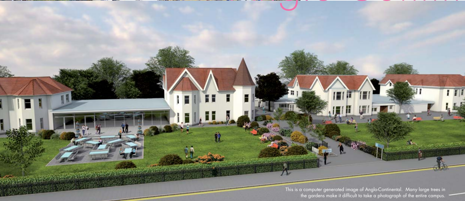
This is a computer generated image of Anglo-Continental. Many large trees in the gardens make it difficult to take a photograph of the entire campus.

Anglo-Continental , within easy walking distance of Bournemouth's town centre, is one of the world's best known English language teaching organisations. It is accredited by the British Council and is a member of the professional body, English UK. Anglo-Continental is also regularly inspected by the Independent Schools Inspectorate (ISI). We offer tuition of the highest quality and provide a wide range of English language courses to meet the needs of students of all ages and professions.