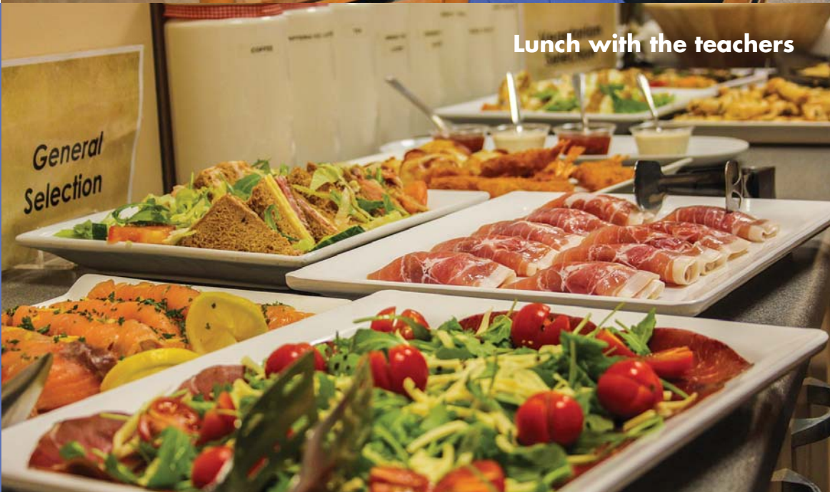
Lunch with the teachers